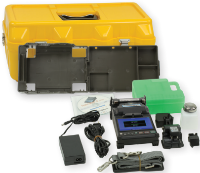
Fujikura 22S Kit 1