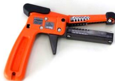
Upper-jaw is open