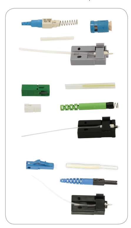
FuseConnect Kits—ST (blue), SC (green), LC (blue)