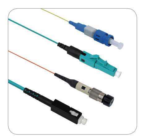
FuseConnect Connectors (SC, FC, LC, ST)